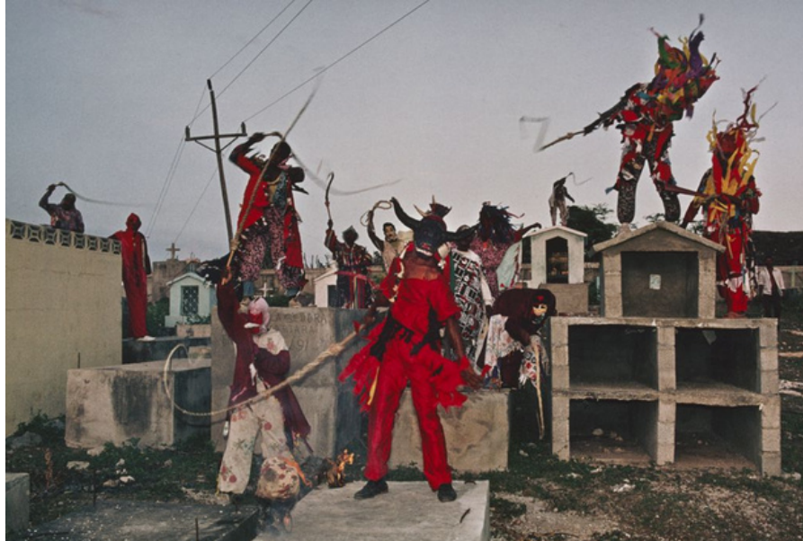
Cachuas Striking with Their Whips the Tombs of Their Ancestors. Héctor Méndez Caratini. 1993. Cibachrome. Photography Endowment Fund. LUF 98 1005.

TO VIEW THE BODIES OF KNOWLEDGE WEBPAGE & ARTWORK LIST FOR EACH GALLERY