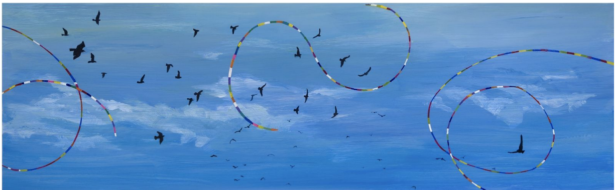
Points of Departure 11"x36", Acrylic on Canvas, 2013