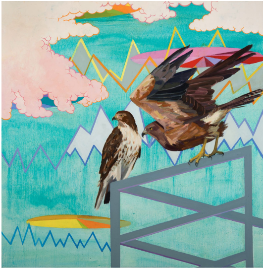
Prismatic Vision 30"x30, Oil on Canvas, 2014

LU | Lehigh University AG | Art Galleries